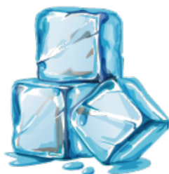
as cold as ice